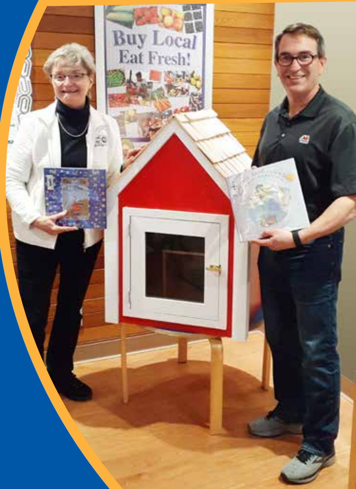
Below Many thanks to Marathon volunteers who built 'Give-n-Take' book houses for United Way. The houses, each with a large swinging door and a small cubby inside, will be used to make loaner books available to children outside the traditional library setting.